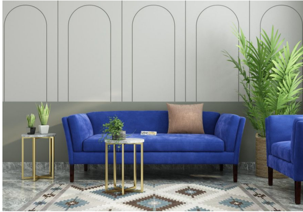
Crimson 3 Seater Fabric Sofa