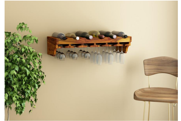
Modern Wall shelf