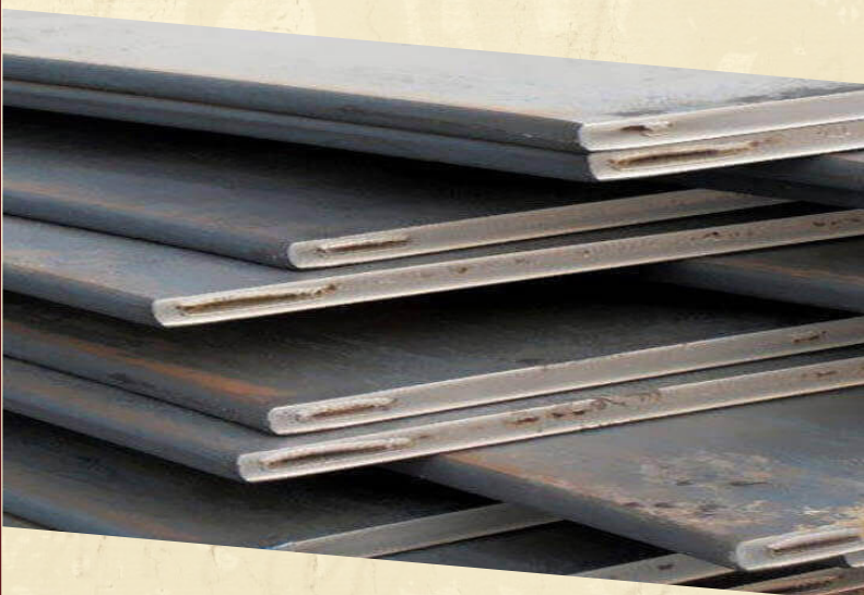
ALLOY STEEL PLATES