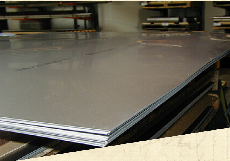
STAINLESS STEEL PLATE