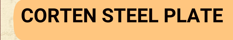
CORTEN STEEL PLATE